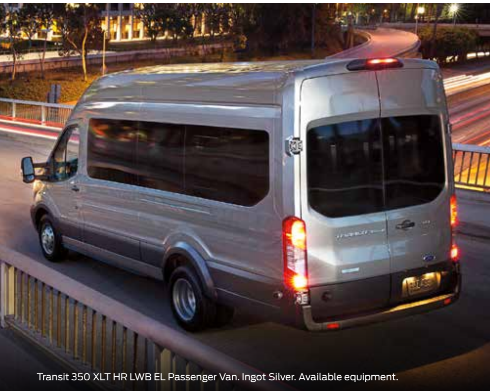
Transit 350 XLT HR LWB EL Passenger Van. Ingot Silver. Available equipment.

Models: Transit 150 XL, Transit 150 XLT, Transit 350 XL, Transit 350 XLT, Transit 350 Heavy-Duty XL, Transit 350 Heavy-Duty XLT