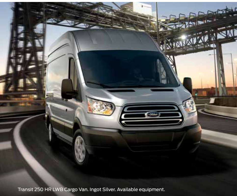
Transit 250 HR LWB Cargo Van. Ingot Silver. Available equipment.

Full-Size Vans Class 1 Models: Transit 150, Transit 250, Transit 350, Transit 350 Heavy-Duty